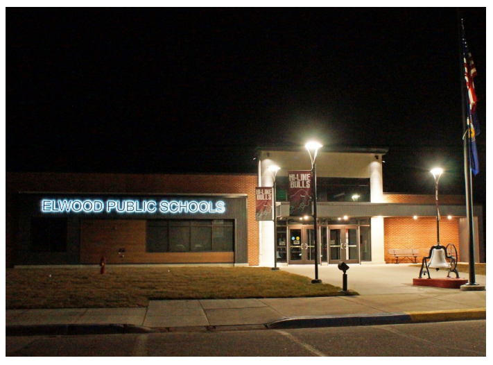
2020 Elwood Public Schools construction project.