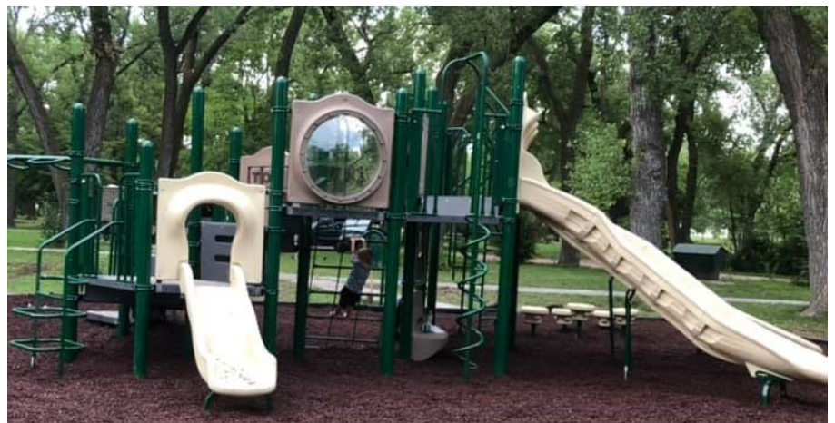
New Playground at Johnson Lake, Result of a partnership with many groups including a community grant from EAF