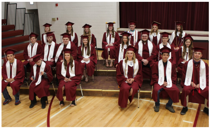
The Elwood High School graduating class of 2019

Thank you to all those who contribute to the scholarship program. You are helping students achieve their dreams!