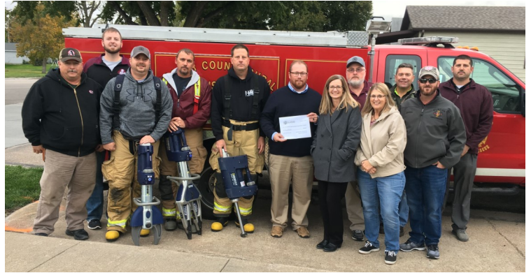
Elwood Fire and Rescue received a community grant to help with the purchase of new Jaws of Life equipment.

YELP- Youth Engaged In Leading People Leadership Academy. 6 students enrolled in 2018, 3 students enrolled in 2019.