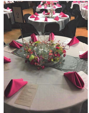
The decorating committee and set-up crew worked hard on the gorgeous table arrangements.

Thanks to the support of the Elwood Area community and all those who donated and attended, the event was a huge success! The net amount raised was $45,000. Of the proceeds, $30,000 will be given to a community project, and $15,000 will be used to further the EAF mission of encouraging, enhancing and providing opportunities for charitable giving, including youth grants. A recipient for the proceeds has not yet been designated, but there are many important community projects that are under consideration.