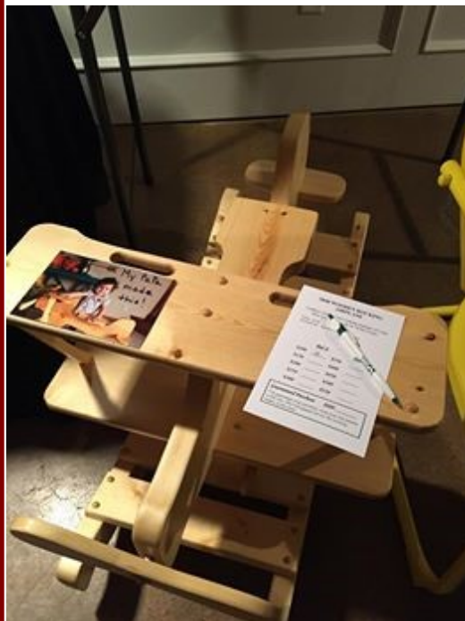
A hand-crafted silent auction item, & dancing late into the night after the auction.