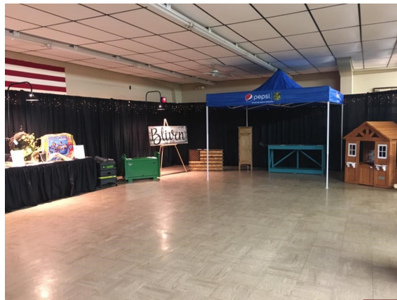
Silent auction items on display in the Legion room. More auction tables were set up in the ball room.

The 5th Annual Elwood Area Foundation Spring Gala, held on March 19th 2016, was a huge success! More than 290 people enjoyed an evening of dining and dancing, and took part in the silent and live auction fundraiser. Proceeds from the event went towards upgrades at the Village Park.